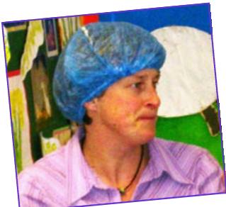
Even the teachers joined in!

The Reception classes have enjoyed a visit from Warburtons Bakery. They made their own hedgehog loaves and sampled different kinds of delicious bread.