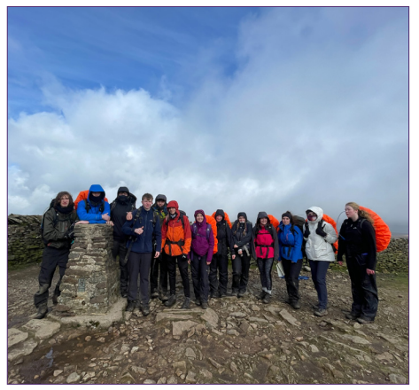
Silver Duke of Edinburgh