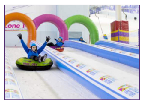
Chill Factore (next page)