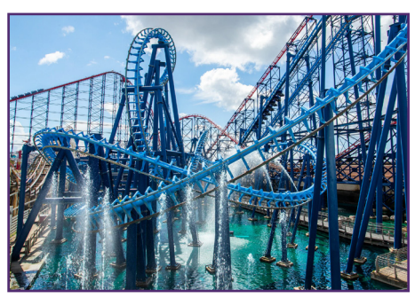
Blackpool Pleasure Beach