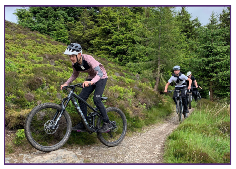
Mountain Biking Trip

Embark on an exhilarating mountain biking day trip, where adventure meets the great outdoors. Ride through rugged trails, winding paths, and scenic landscapes as you challenge yourself on diverse terrains. Whether you're gliding through lush forests, tackling rocky climbs, or racing down thrilling descents, every moment promises adrenaline and excitement. Take in the breathtaking views along the way, with breaks to soak in nature's beauty and recharge. Perfect for thrill-seekers and nature lovers alike, this day trip offers the ultimate escape into the wild on two wheels.